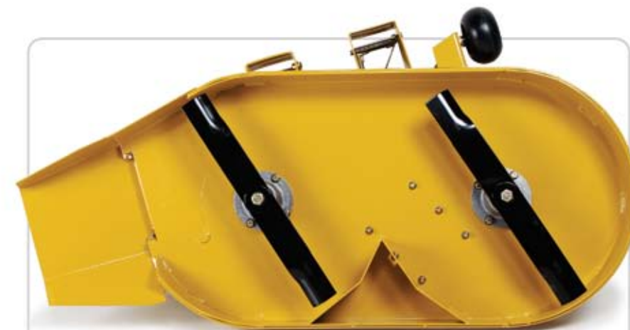
Heavy-duty welded decks come with a lifetime warranty on the leading edge